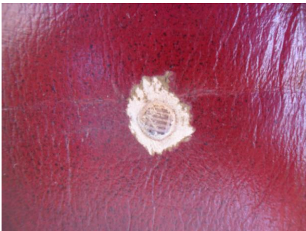
SUB PATCH APPLIED 1